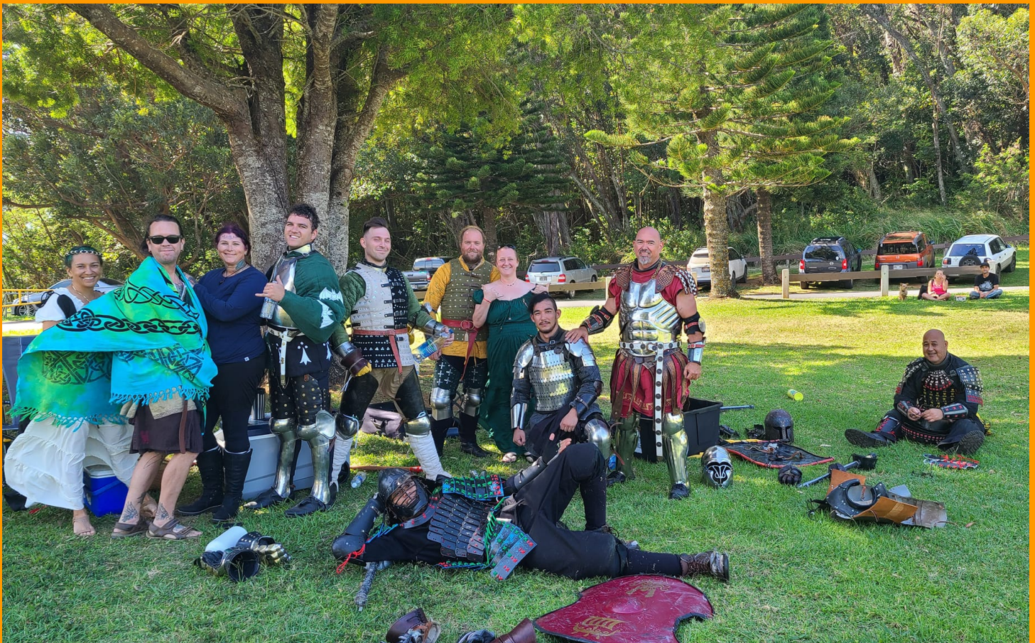
Her Excellencies Birthday in Maui

BARONY OF WESTERN SEAS ~ KINGDOM OF CAID ~ SOCIETY FOR CREATIVE ANACHRONISM The Official Newsletter of the Barony of Western Seas March 2022 - June 2022 ~ A.S. LVI