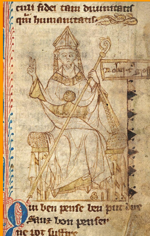
Robert, the Bishop of Lincoln.

So, what is the ultimate goal of good teaching? In my humble opinion, the ultimate goal of good teaching is to have the student (and their efforts) eclipse those of the teacher. That is what happened here with Robert Grosseteste, and probably why many of you haven't heard of him. Many of the concepts described here were refined and generalized by one of his most notable students, Roger Bacon.