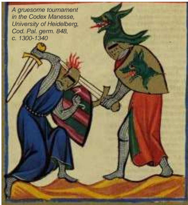
A gruesome tournament in the Codex Manesse, University of Heidelberg, Cod. Pal. germ. 848, c. 1300-1340