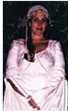
Bantiarna Sadhbh inghean Uí Gonghal