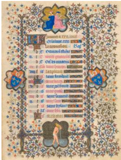
Calendar page from The Belles Heures of Jean de France, Duc de Berry, 1405–1408/1409.