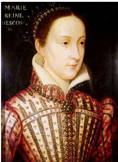
Mary, Queen of Scots (1542–1587)

When his father died, he returned to his mother's Gypsy clan. The Gypsies/Tinkers would make their living buying and selling horses, and were popular with the ordinary country folk (Wikipedia). Eventually he became an out-