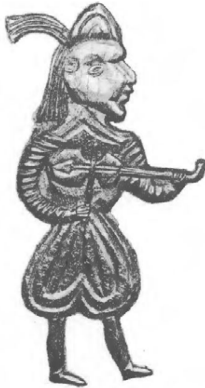
A woodcarving from south-west Scotland, showing a 'fitheler' of c. 1600.

Many kings and queens of Scotland enjoyed fiddle music, and had fiddlers as part of their court musicians, including Mary, Queen of Scots (1542–1587). However, on one occasion, a visiting French historian and soldier witnessed in 1561 that when Mary came to her window in Holyrood Castle to greet the public, "there came ... 5 or 600 citizens of the town, who gave her a concert of the vilest fiddles and little rebecs, which are as bad as they can be in that coun-