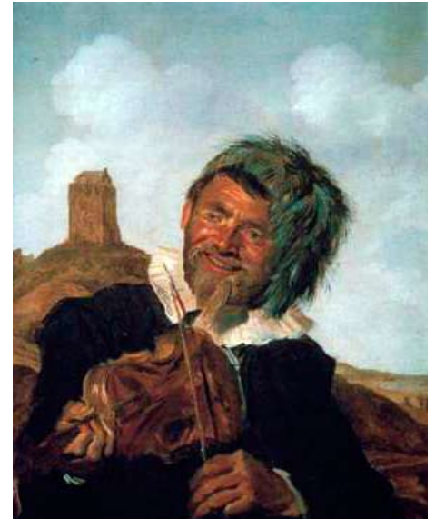
This painting of a fiddler is by Frans Hals and was painted in 1630. It is housed at the Museo Thyssen-Bornemisza, Madrid.

Apparently some of these musicians may have continued to