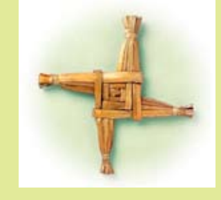
St. Bridget's cross

protection for the house from fire and evil, and is hung in many Irish kitchens for this purpose.