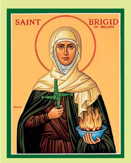
Icon of St. Bridget of Ireland