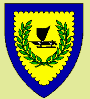
Barony of Western Seas http://westernseas.org